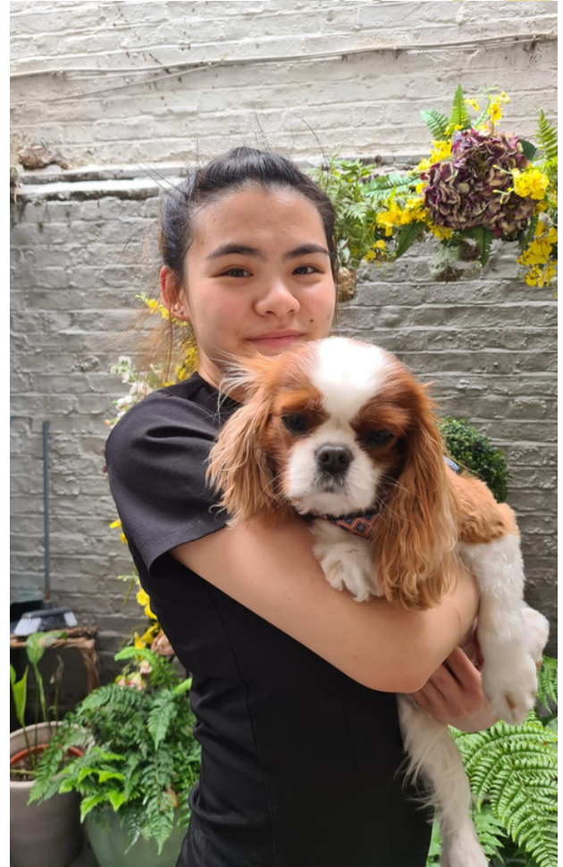
Charlie Love My Human

Having an apprentice has also given us a fresh face with new ideas and perspectives. Young, hungry talent helps us massively, they can see aspects of our business that we might overlook. Our apprentices are the future of our industry and incorporating them early is so important to the progression of Dog Grooming and Welfare."